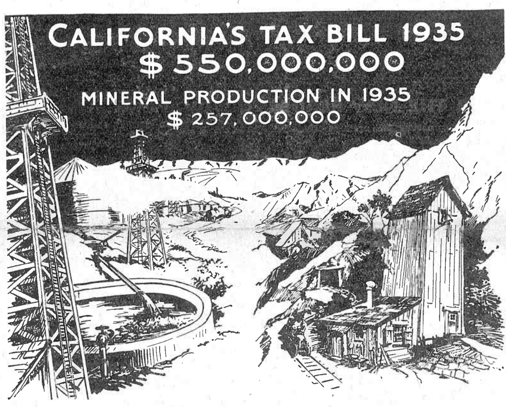
Cartoon prepared by the California State Chamber of Commerce